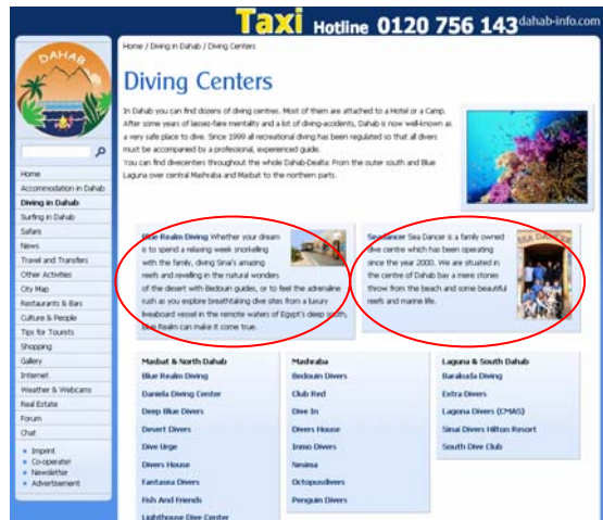
Promotional space on Overview-page for diving centres (as well as accommodation, hotels etc..)

If you want to promote your best offers and draw additional attention to your business, you can book these prominent spots in a personalized package. Book now as there is only limited space!